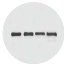
WB - Anti-GAPDH antibody [EPR16891] (ab181602)